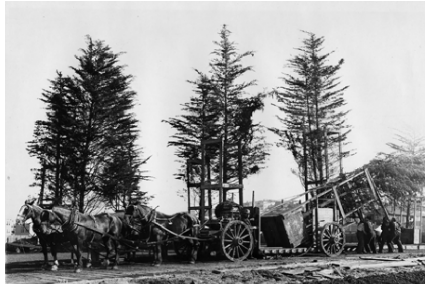
Transporting Redwoods by Horses in Golden Gate Park (c.1914), Panama-Pacific International Exposition, Courtesy San Francisco Historical Photograph Collection

BAN 5 Ground Scores Several Tours of San Francisco Park and Forest